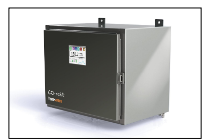
Tiger Optics CO-rekt analyzer

Tiger's CO-rekt<sup>TM</sup> analyzers have proven highly beneficial in HyCO and, similarly, SMR (Steam Methane Reformer) processes for analysis of CO and other contaminants in petrochemical feedstock. That's because our CW-CRDS (Continuous Wave Cavity Ringdown Spectroscopy) technology is ideally suited for process monitoring, where performance factors, like robustness, uptime, throughput, low maintenance and ease of use are at a premium. Indeed, one user, who has deployed our CO-rekts widely, calculates a 13-month payback on investment.