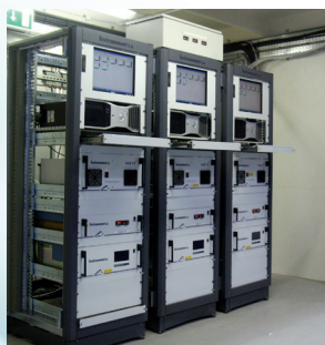
MIR FT rack cabinet